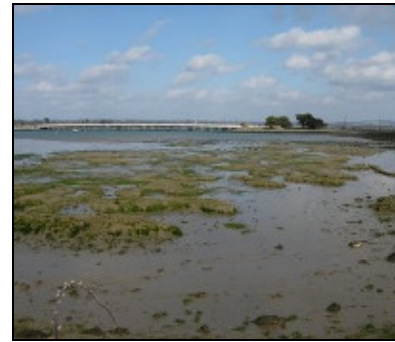
Mudflats by The Hayling Billy Path