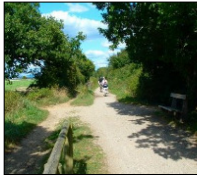
Hayling Billy Coastal Path