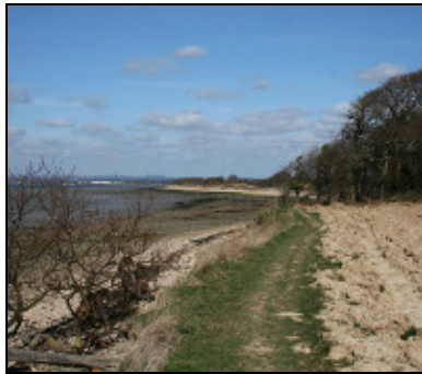
Langstone Harbour